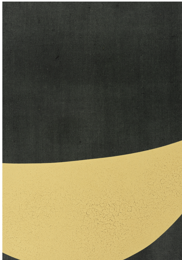
Magdalena Skupinska Pollen , 2022 Indigo and pine pollen 55.2 x 45 cm

It is definitely an ongoing process of experimentation. I am constantly learning as new ingredients enter my studio. The amount of plant material is boundless and so there is a huge spectrum of possibilities. I try not to work methodically in the studio, as I feel like chance and spontaneity are my best teachers, as well as the materials themselves. As I experiment, new things come up: new ideas and leads. So one thing takes me to another. It is a very playful process.